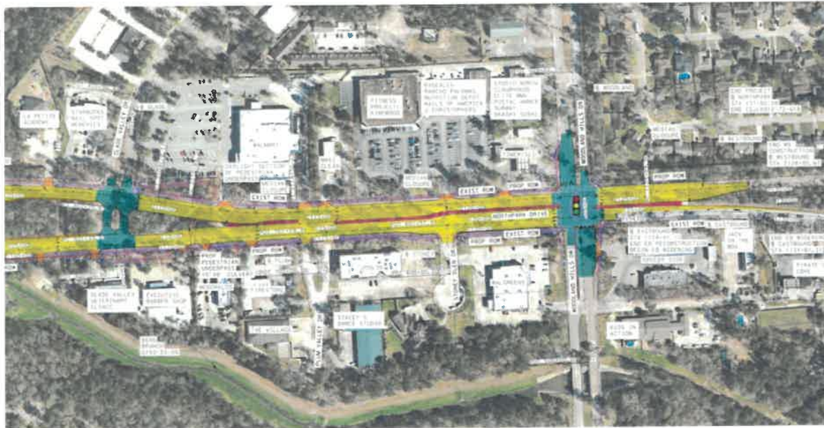
Portion of Northpark Phase II through the Northpark Place Commercial Association. Purple represents additional right of way that will need to be acquired.

Don't miss this meeting, especially if you live, work or go to school in the northern part of Kingwood.